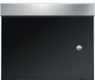
COUNTERTOP COOLER (LARGE)

This model boasts a removable milk tank and offers the option of sensors for milk temperature and a milk empty message.