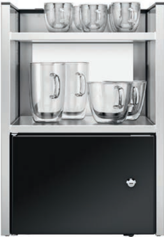
CUP & COOL, WIDE

ONE UNIT, TWO FUNCTIONS: WARMING AND COOLING