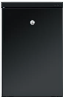
COUNTERTOP COOLER (MEDIUM)

Available either with or without a large digital display on the front panel, the two variants of WMF's small Countertop Cooler both have a removable milk tank with a 3.5-litre capacity, and each is fitted with a thermostat and separate on/off switches. Suitable for self-service venues, they are lockable with a removable seal.