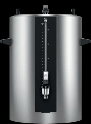
HEATED THERMAL CONTAINER (20L)