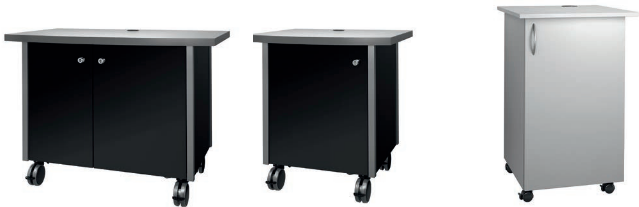
MOBILE COFFEE STATION 125+ / 85+

DELIVERING COFFEE INDULGENCE, IN TOTAL AUTONOMY