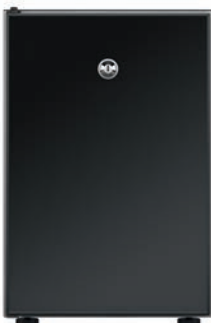
COUNTERTOP COOLER (SMALL)

Available either with or without a large digital display on the front panel, the two variants of WMF's small Countertop Cooler both have a removable milk tank with a 3.5-litre capacity, and each is fitted with a thermostat and separate on/off switches. Suitable for self-service venues, they are lockable with a removable seal.