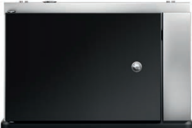
UNDER-MACHINE COOLER (WMF 9000 S+)

The large capacity of this Countertop Cooler makes it suitable for use with either one or two WMF coffee machines, with milk hose routing on both the left and right sides. Milk temperature and milk empty sensors are available as an option.