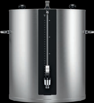
HEATED THERMAL CONTAINER (40L)