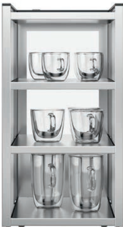
CUP RACK, NARROW

Made with high-quality, easily cleanable stainless steel and shatterproof glass, WMF cup racks are designed to be positioned directly next to the coffee machine. So your cups will always be close at hand, and just the right temperature. Transparent side panels make for easy inspection, and coloured LED lighting can be adjusted to suit your venue.