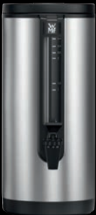
THERMAL CONTAINER (2.4L)

The range of thermal containers for use with the WMF 9000 F includes an insulated pot with a 40-litre capacity and a 20-litre model, as well as a 2.4-litre model which can be filled from the pot brewing arm, and is also suitable for use with the WMF 9000 F (Internal Storage).