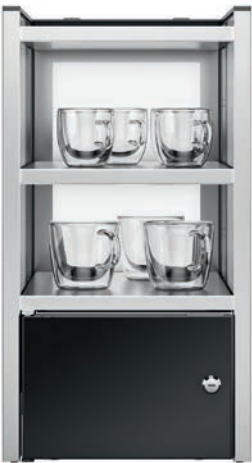
CUP & COOL, NARROW

Contained within the same footprint as a standard cup warming rack, WMF Cup&Cool units combine both cup warming and milk cooling functions. For maximum hygiene, the milk tank is removable, easy to clean and easy to fill, while the optional milk volume sensor lets you know when to refill. The lockable door is ideal for self-service venues.