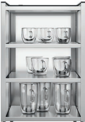
CUP RACK, WIDE

PERFECTLY WARMED CUPS, STYLISHLY DISPLAYED